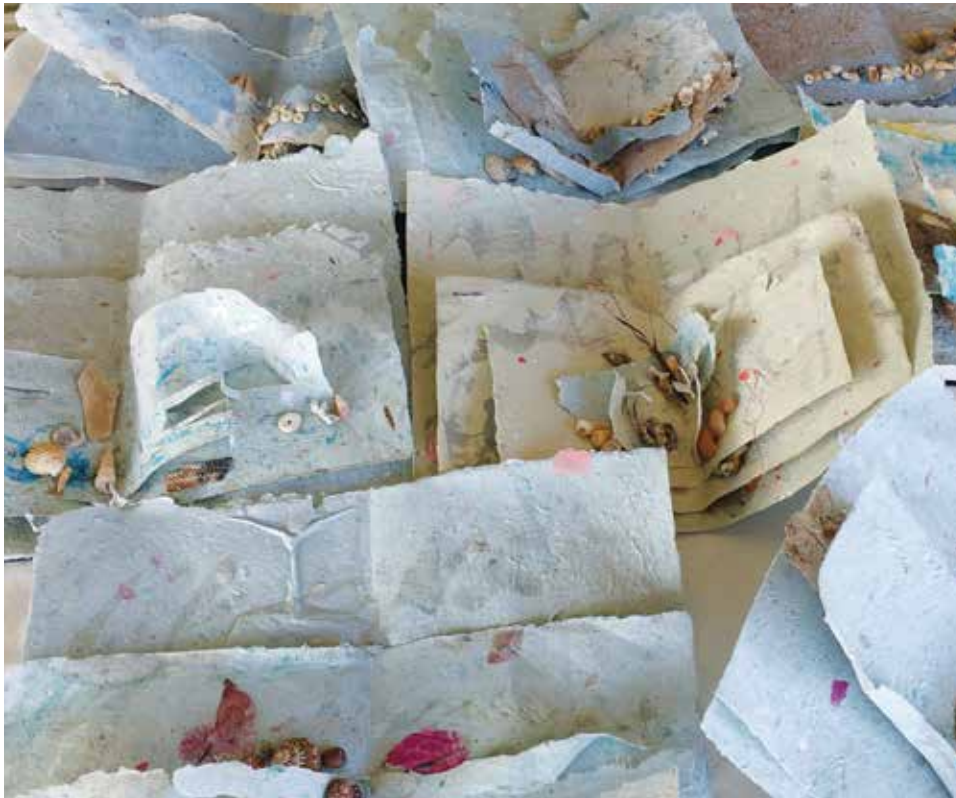
TOP: Pilar Sala Vallejo, Libros Libres Son de Mar (Free Books) ; 2016; 16 paper art booklets from an installation on metal columns, recycled paper, snails, beach materials; manual paper fabrication; 120 x 60 x 65 cm, (variable for installation), 16 x 21 x 4 cm (open booklet).